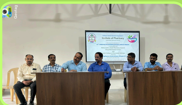
Dignitaries present on the dias.