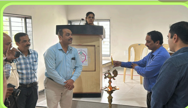
Inauguration of the program with lighting the lamp.