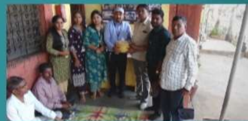
I-DCP students visited Elderly orphanage house, Shahu naka, Kolhapur