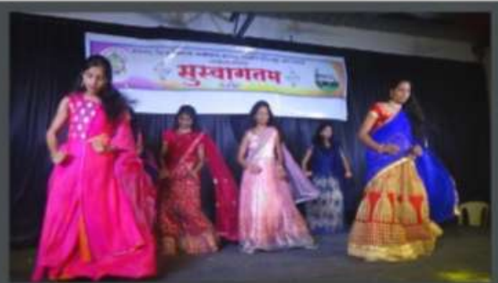
ANNUAL DAY CULTURAL EVENTS