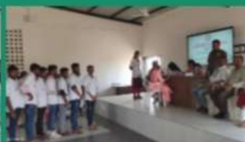
Free blood Check up of Students