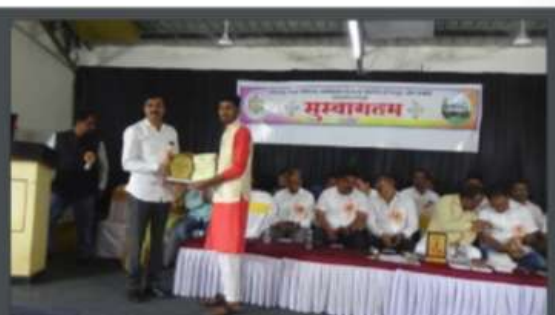
PRIZE DISTRIBUTION BY THE HANDS OF GUESTS