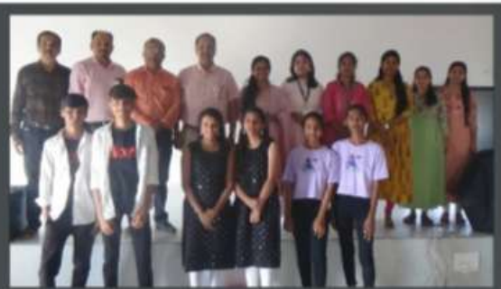
VARIOUS DAYS CELEBRATIONS