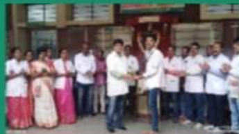
Felicitations of Pharmacists