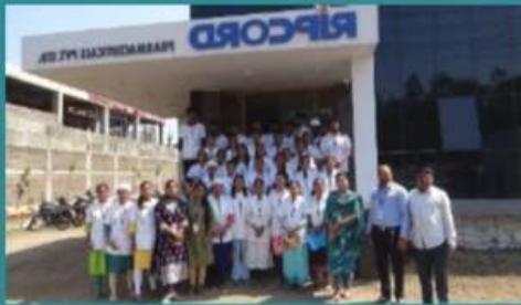
I-DCP students visited Ripcord Pharmaceuticals Pvt. Ltd.