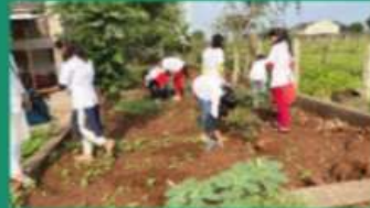
I-DCP students visited to PHC, Ujalaiwadi