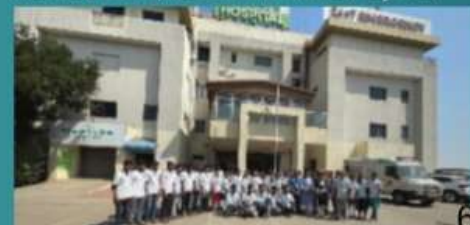
II-DCP visited Athayu

As a part of the curriculum of Hospital & Clinical Pharmacy, visit to Athayu Hospital was organized for 2nd year students on 2nd Feb. 2024 at 10:30 am. Students were divided into various groups and informed about various departments of the hospital. Students were explained about the working culture at hospital, patient related activities, SOPs followed, and clinical aspects.