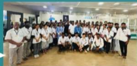
II-DCP students visited Sushil Pharma LLP, Ich

As a part of the curriculum of Community Pharmacy and Management, 'Sushil LLP, Ichalkaranji. Visit was organized for 2nd year students on 2nd Feb. 2024 at 02:30 pm. We reached Sushil LLP, Ichalkaranji at 02:30 pm. After that students were subjected to get information about LLP and its management. The team of LLP provided information about Sushil LLP organization. Students were explained about the working of wholesale pharmacy, business related activities, SOPs followed, and basic things related to commerce etc.